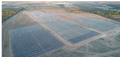
Baking Board Solar Farm, Chinchilla, QLD | 2019