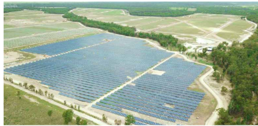
Darling Downs Solar Farm, Kogan, QLD | 2018

We've built a reputation for being reliable, precise, being an employer of choice, and delivering quality permanent and temporary recruitment services to our clients.