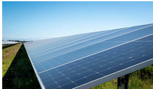
Edenvale Solar Park, Chinchilla, QLD | 2022